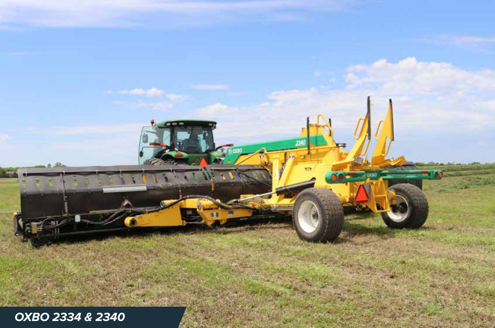
OXBO 2334 & 2340