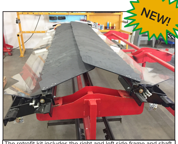
The retrofit kit includes the right and left side frame and shaft. (The kit does not include new motors)

In the new design the shaker pan motor is set back into the frame with additional protection mounts.